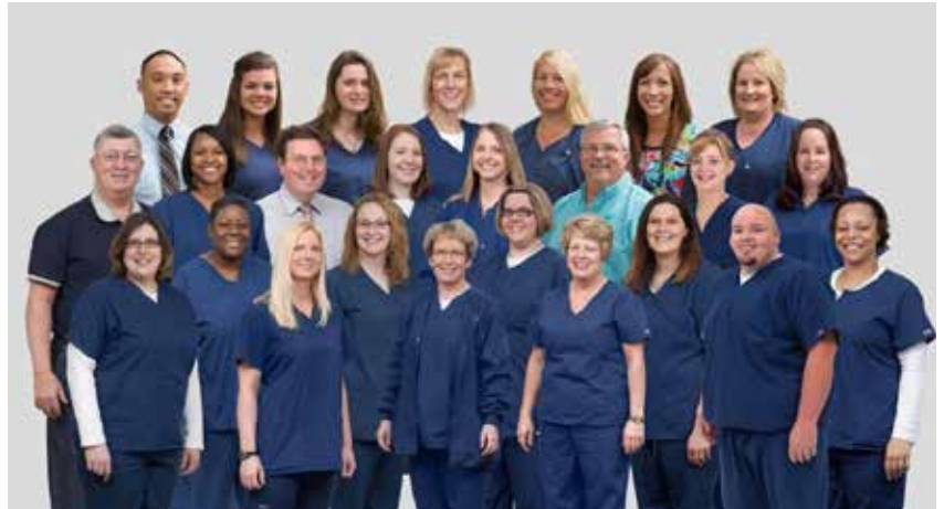
Your Illinois CancerCare Pharmacy Team