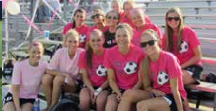
Upper classmen during freshman/sophomore game